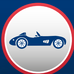
CLASSIC & VINTAGE