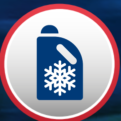
ANTI-FREEZE & COOLANTS