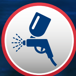
INDUSTRIAL PAINTS & COATINGS