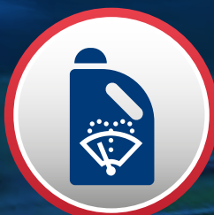
WORKSHOP & CLEANING