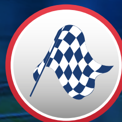
MOTORSPORT & MOTUL