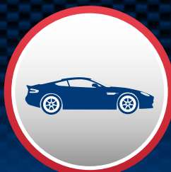
AUTOMOTIVE & PASSENGER CAR