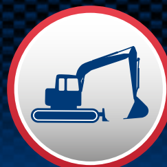
PLANT & OFF ROAD