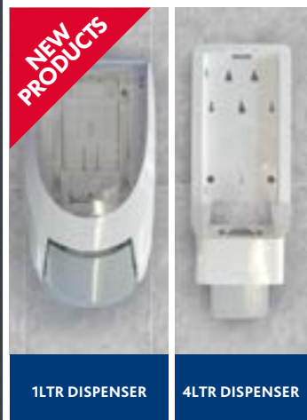
1LTR DISPENSER 4LTR DISPENSER 5LTR DISPENSER